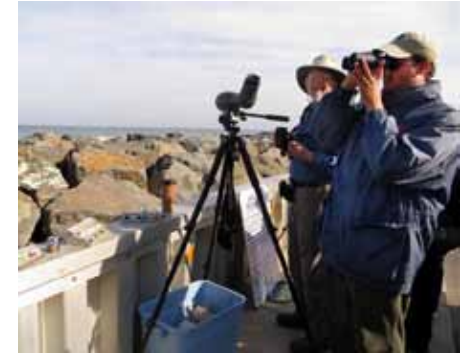
Cape May counters

Are you wondering where you might go for your next birding trip? If you haven’t been to Cape May, add it to your list. For me, the journey to Cape May may well become an annual migration. I can feel its pull even now. ☘