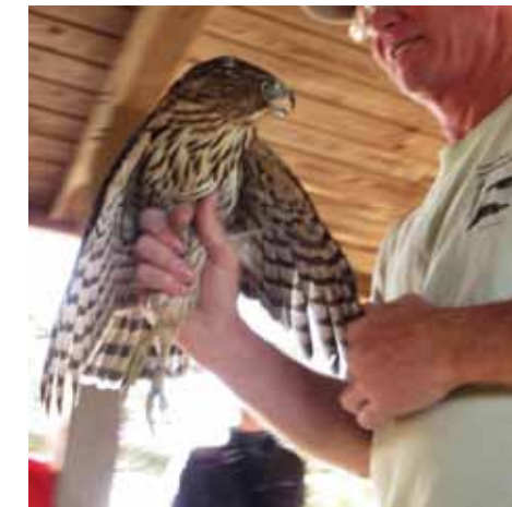
Banding a Cooper's Hawk